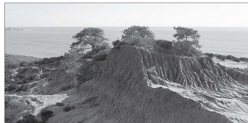
View from Broken Hill overlook

Reserve's longest trail, including access to the beach. Features chaparral, few trees, and scenic overlook pictured below.